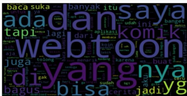
FIGURE 6. POSITIVE SENTIMENT WORDCLOUD

This section provides a visual representation of user feedback on the Webtoon application. Utilizing a word cloud format, it showcases frequently occurring words within the reviews. The size of each word corresponds to its frequency in the reviews: the larger the word, the more often it appears. This visualization offers a quick and intuitive way to grasp common themes and sentiments expressed by users regarding their experiences with the Webtoon application.