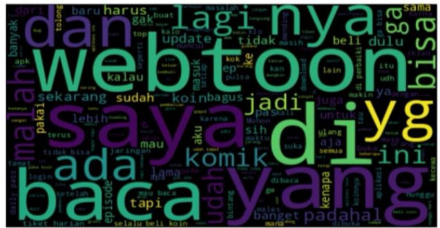
FIGURE 7. NEGATIVE SENTIMENT WORDCLOUD

application. Its frequent appearance suggests that users often mention the application by name, indicating a strong association with positive sentiments.