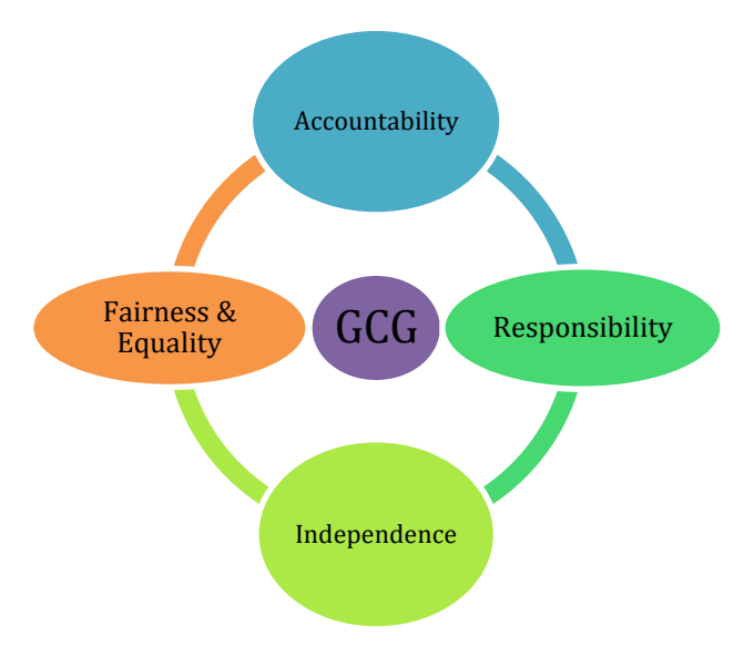
Figure 2. Principles of Good Corporate Governance

First, accountability. Islam emphasizes accountability with the Hahslm Theory approach or the value of prayer. The value of prayer is a "mission" of worship to Allah. Have a target to remember Him, "Establish prayer to remember Me" (aqim al-ṣalāh li zikrī). As an institution that receives deposits (wādi'ah) from customers, Islamic banks are obliged to account for the achievements of the implementation of the organization's mission in achieving the stated goals, in the form of accountability that is measurable, open and periodic (kitāban mauqūtan such as prayer). Islamic financial institutions must have an internal audit function that monitors sharia compliance, such as prayers according to fiqh rules based on arguments understood by scholars (ṣallī kamā raitumūnī uṣallī).